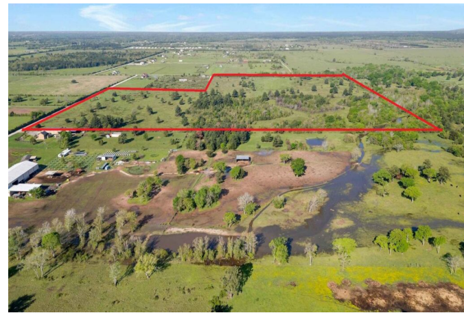
County: Waller State: Texas Zip: 77484

Acres: 81 List Price: $2,990,710 City: Waller