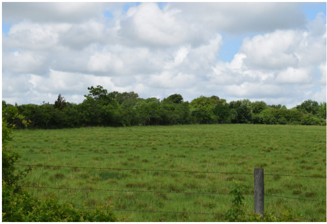
County: Waller State: Texas Zip: 77484

Acres: 15 List Price: $375,000 City: Waller