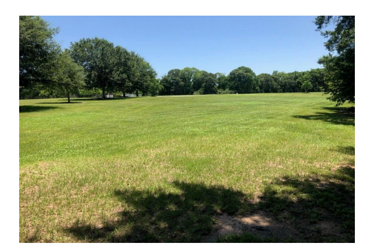
Acres: 5 List Price: $169,000 City: Hempstead

If you're looking to build your Dream Home in the Country, look no more. Bring your Family, Horses or Ag projects out to this 5 acre tract which is absolutely gorgeous. Scattered hardwood trees, seasonal creek and rolling terrain overlooking a lake. Located in a very quiet neighborhood which has been beautifully maintained and within the highly accredited Waller School District. Literally just a couple of minutes from HWY 290 makes it an easy commute to Houston, Brenham or College Station. Don't miss out!