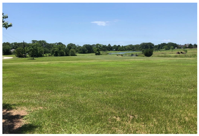
County: Waller State: Texas Zip: 77445