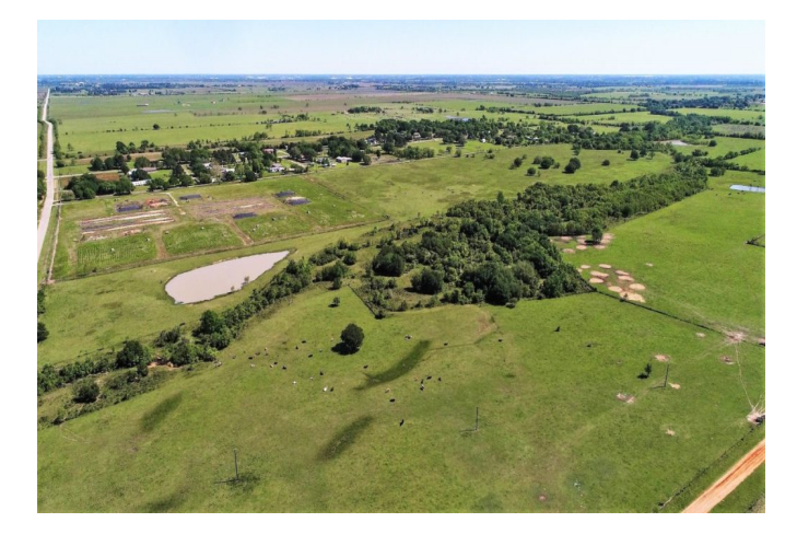
Acres: 141 List Price: $1,763,012 City: Waller

Great residential or commercial property! Approximately 1,075' frontage on Cochran Rd. Property is 141 acres of unrestricted rolling pasture with seasonal creek, 4 ponds, fenced & cross fenced with 3 barns & working pens. Beautiful wooded area along the creek provides cover for your cattle and other wildlife. This property has "Certified Organic Farm" history. Bring the horses & cattle and build your dream home in the country. Seller will grant easement to gravel driveway (1,886') along south property line. Priced to sell!